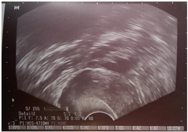
Figure 1. Sonography before induction of ovulation-normal ovary without dominant foliculs.

An informed consent was obtained from the patient for publication of this case report and accompanying images.