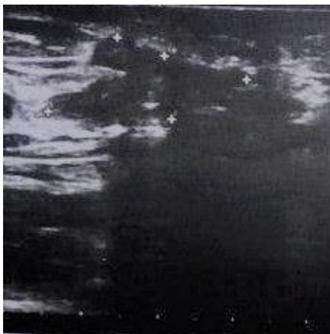
Figure 2. Ultrasonography image shows a 26x12x25mm vascularized, hypoechoic, irregular in shape lesion in the abdominal wall, 7mm deep to the skin.