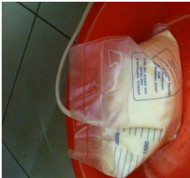
Figure 2: Chylous pleural fluid

Analysis of the fluid showed a cholesterol content of 1.3 mmol/l and triglycerides content of 7.19 mmol/l (NR<1.24). There were numerous white blood cells with 100% neutrophils and with no evidence of malignant cells. Protein count in the pleural fluid was 22.7 g/dl, and glucose 10 mmol/l. LDH and pH on pleural fluid were not done.