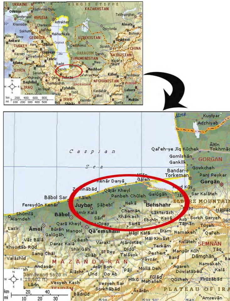
Fig. 1: Geographic location of the study area along the southern coast of the Caspian Sea, between Juybar and Behshahr regions