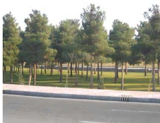
Fig 1: Pine trees community cover arrround the traffic zone of urban area in Tehran

The needle samples supplied from the trees according to the main wind direction (i.e. the highest wind speed) were obtained from each parts of tree and then were homogeneously mixed. The total number of collected samples was 53, distributed as follows: 15 samples from the urban, industrial and highway sites and 8 samples were from control site. The samples were separately collected into clean cellulose bags and brought to the laboratory on the same day. In laboratory, the samples were carefully washed three times with distilled water to remove adhering particle (Babaoglu, et al., 2004). All needle samples were weighed and then dried in an oven at 70 °C for 48h. The samples (1 g) of finely ground needles were digested with concentrated HNO 3 in a microwave system. Heavy metal concentrations were measured by the flame atomic absorption spectrophotometer, Perkin-Elmer AAS analysis 300 model, with three replicates. Used metal standards were provided from Merck, Germany. The analysis of variance (ANOVA) was used to compare the significant difference in the mean concentration of heavy metals between the sampling sites. F is a parameter in the level of 5 %. Pearson's correlation coefficient was used to measure the degree of correlation between logarithms of the metal concentrations. ANOVA test and Pearson's