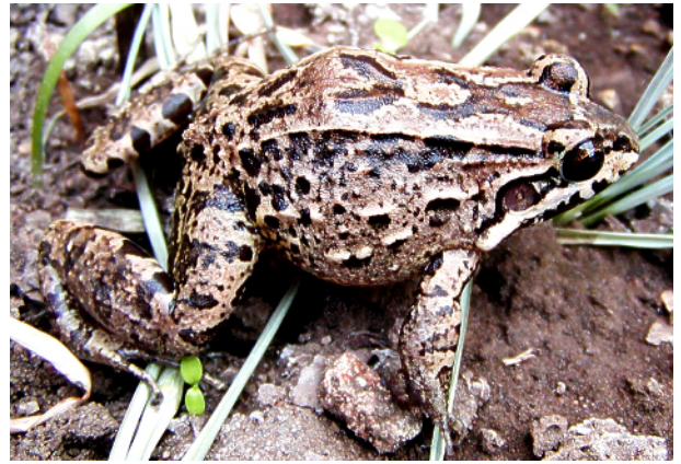
Fig. 1 Adult Leptodactylus labrosus observed at night on a Bambu plantation, on the margin of a small stream, at the Centro Científico Río Palenque, province of Los Ríos, Ecuador, 11 November 2004

The diet of the studied L. labrosus includes 18 prey categories, all invertebrates. These categories can