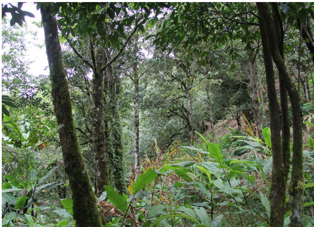
Figure 3 Habitat of Japalura chapaensis in Lvchun, southeastern Yunnan Province, China

For the remaining mainland congeners from non-Himalayan regions, J. chapaensis differs from J. fasciata by having a longer tail (TAL >204% SVL vs. <180%) and longer hind limbs (HLL >74% SVL vs. <69%), and by the absence of a transverse hourglass-shaped marking on the dorsum (vs. present); from J. batangensis , J. brevicauda , J. dymondi , J. flaviceps , J. grahami , J. iadina , J. laeiventris , J. splendida , J. vela , J. yulongensis , and J. zhaoermii by having significantly enlarged nuchal crest scales (vs. not significantly differentiated from dorsal crest scales), bright yellow oral cavity (vs. flash color or blackish blue), and by the absence of a transverse gular fold (vs. present); from J. varcoae by having a concealed tympanum (vs. exposed) and enlarged, differentiated nuchal crest scales (vs. not significantly differentiated); and from J. micangshanensis by having significantly enlarged nuchal crest scales (vs. not significantly differentiated from dorsal crest scales) and by the presence of gular spots (vs. absent).