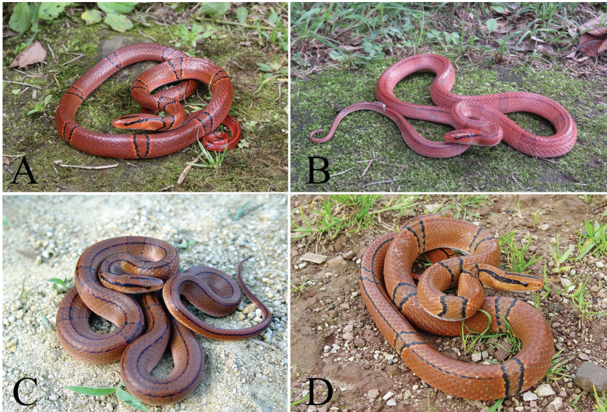
Figure 1 General view of Oreocryptophis porphyraceus from Yunnan (A: O. p. pulchra ), Zhejiang (B: O. p. vaillanti ), Hainan (C: O. p. hainana ), and Sichuan (D: central China population)

Chengdu Institute of Biology (CIB), Chinese Academy of Sciences (CAS). Specimens were scanned at 70 KV with a flux of 114 \mu A, with other parameters set following Shi et al. (2017). A total of 720 transmission images were reconstructed into a 2 048×2 048 matrix of 802 slices using VGStudio max (a three-dimensional reconstruction program) developed by CIB, CAS. Based on the photos, 20 characters were recorded or measured by direct counting, Snake Measure Tool software, or digital slide-caliper. Measurements and descriptive methods for different bones and characters followed Cundall (1981) and Guo et al. (2010) and their abbreviations are listed in Appendix II.