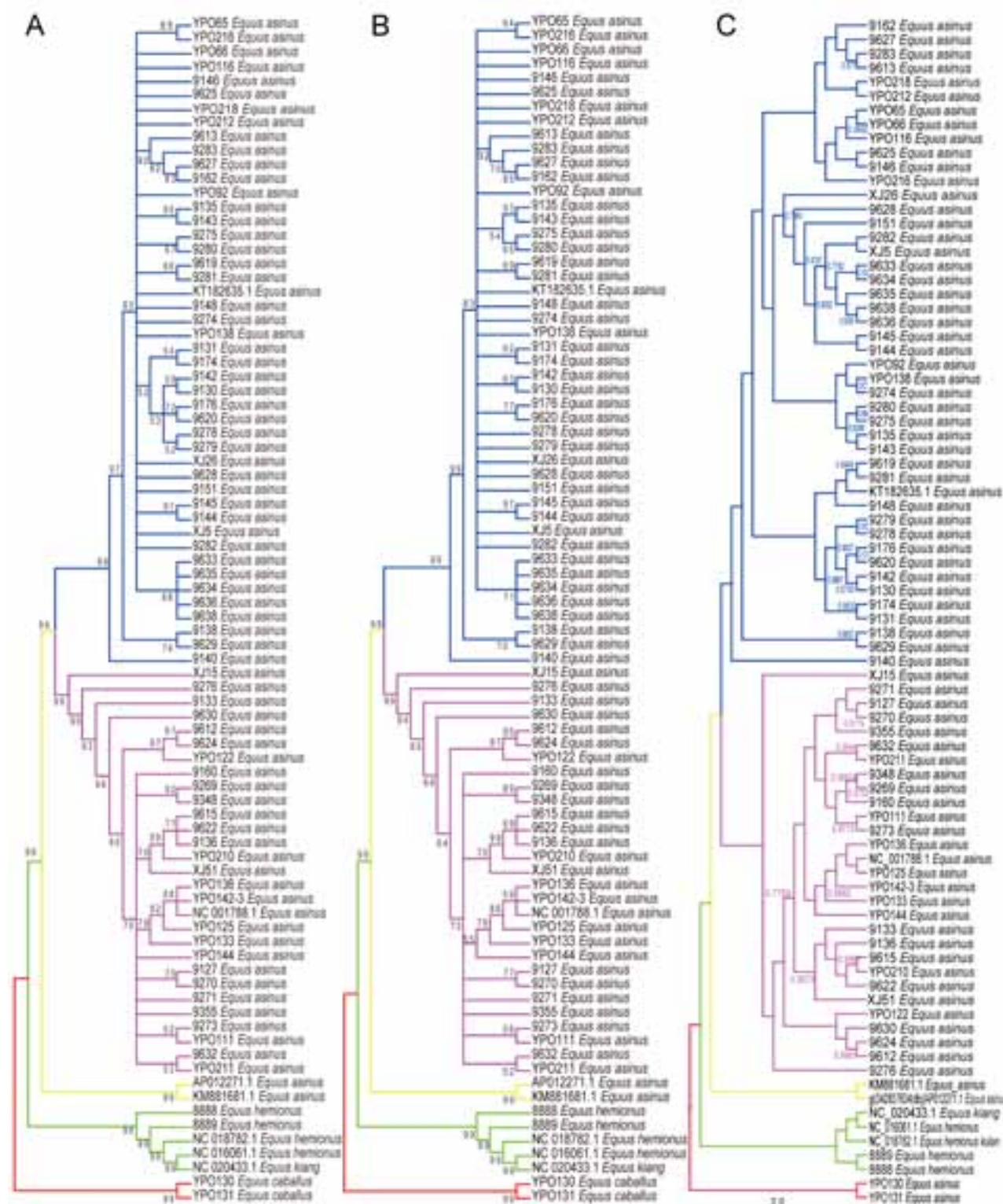
Figure 1 mtDNA genome phylogeny of Equus

A: Neighbor-joining tree; B: Maximum likelihood tree; C: Bayesian tree. Colored branches denote different categories. Red: Horse; Green: Asiatic wild ass; Yellow: Somali wild ass; Blue: Clade I lineage; Magenta: Clade II lineage.