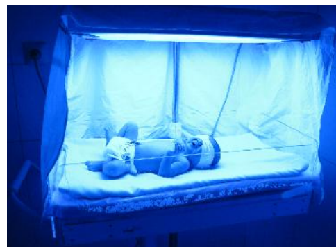
Fig. 1: White plastic cover around the phototherapy unit

All the infants under study, before starting phototherapy had detailed physical examination and necessary tests including determining blood group of mother and infant, peripheral blood smear, reticulocyte count, direct and indirect