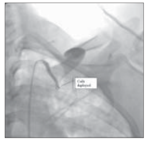
Figure 2: Showing coils in-situ and successful embolization of bronchial artery