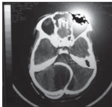
Figure 2: Post operative CT scan with shunt in situ

cyst was clear, colorless with 22 mg/dl protein, 47 mg/dl sugar. Two days later she was successfully weaned from the ventilator. A convulsion on the fifth postoperative day was treated with loading and maintenance dose of phenytoin. Repeat CT scan [Figure 2] showed the shunt