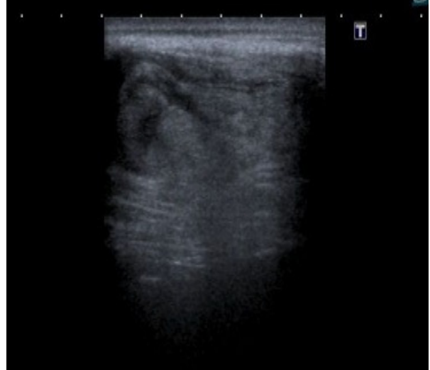
Figure 4: Review ultrasound which was done immediately after CECT and 24r hours from initial US, showed that the cystic lesion was sub totally filled with echogenic fat.

subcutaneous fatty mass with thin marginal rim of fluid. No bowel loop inside. Right kidney is seen in its normal location.