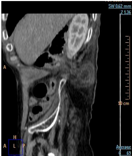
Figure 3b: CECT of the abdomen (a- axial and b- sagittal reformats) showed defect in-between the muscles of the right posterolateral abdominal wall. Retroperitoneal peri-renal dirty fat, with multiple strands, is seen protruding through defect forming

subcutaneous fatty mass with thin marginal rim of fluid. No bowel loop inside. Right kidney is seen in its normal location.