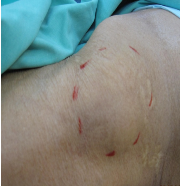
Figure 1. Photograph of 79-Year Old Female Patient with Right Lumbar Swelling