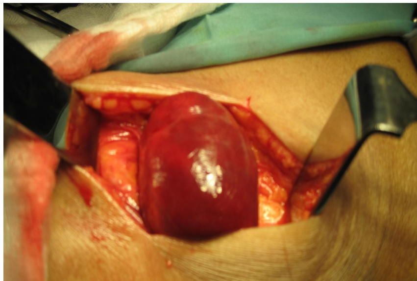
Figure 5: Intraoperative photograph showing defect and protruding hernia sac.