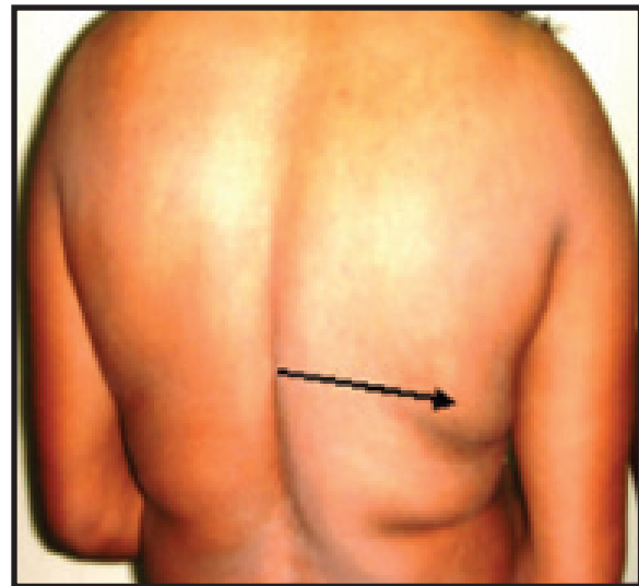
Fig 2: Excess fat on the back

A diagnosis of lipodystrophy was made, and the patient's treatment was changed to AZT/3TC/NVP. She took this regimen for 2 years (2007). In 2008, she developed anaemia thought to be secondary to AZT. As a result her treatment was changed to TDF/3TC/EFV. She took this regimen faithfully till May 2011. At this time she had her first CD4 cell count and HIV RNA tests. The CD4 cell count was as >800 cell/mL and the HIV RNA was <400 copies/mL. On personal initiative, the patient visited South Africa and underwent a thorough medical examination in May 2011 including HIV testing. The HIV test using rapid tests was negative and a confirmatory Western blot was also negative. HIV RNA was undetectable.