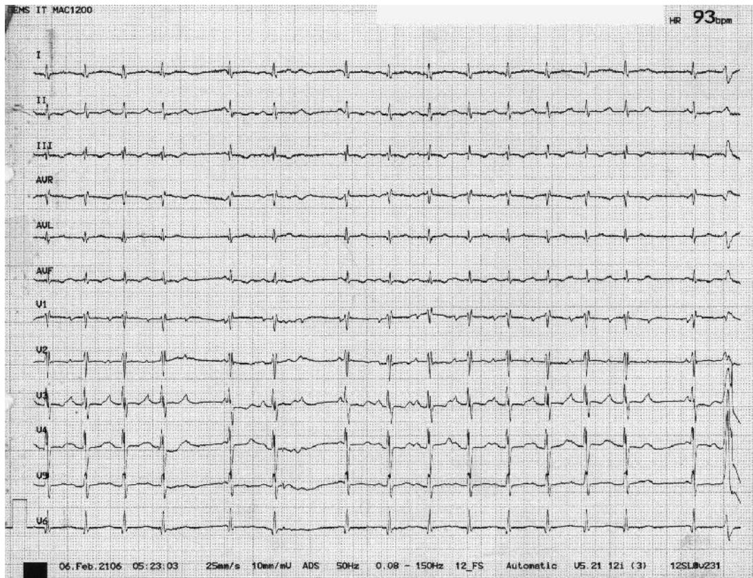
Fig 3: The 12 leads electrocardiogram from the previous admission of the patient revealed second degree Mobitz type 1 (Wenkebach) heart block.

calcium channel blockers have shown to be useful in preventing NTBI from entering cardiomyocytes via these channels [8].