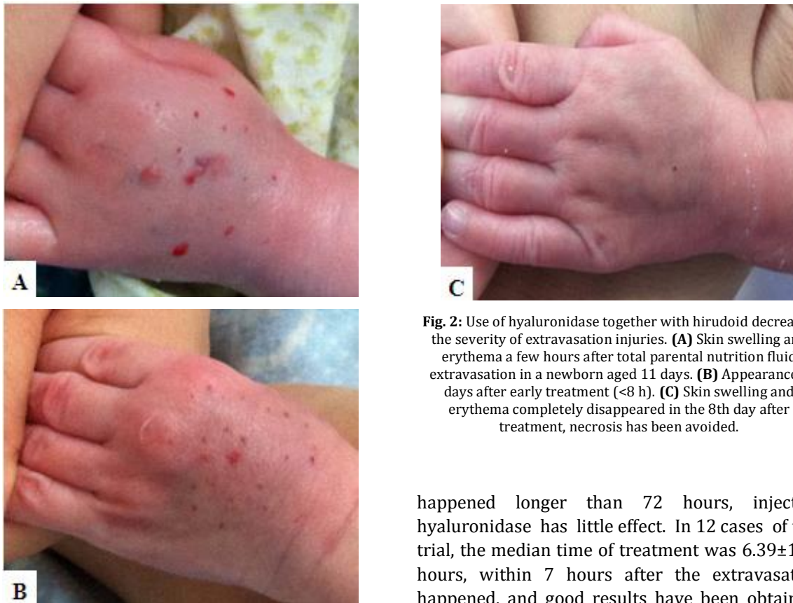
Fig. 2: Use of hyaluronidase together with hirudoid decreased the severity of extravasation injuries. (A) Skin swelling and erythema a few hours after total parental nutrition fluid extravasation in a newborn aged 11 days. (B) Appearance 2 days after early treatment (<8 h). (C) Skin swelling and erythema completely disappeared in the 8th day after treatment, necrosis has been avoided.

injecting hyaluronidase is 8 hours, and 3 hours for high risk medications, such as dopamine and epinephrine. But if exceed the golden time and the extravasation has done damage to the patient or developed to grade 3 or grade 4, hyaluronidase is still injected to prevent further damage, and has been effective. However, if the extravasation has