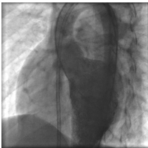
Figure 2. Left Ventriculogram After Advancing of an Appropriately Sized Sheath From the Femoral Vein Across the VSD

chosen ADO was at least 2 mm larger than the narrowest of the measured VSD diameter in right side by ventriculogram. Subsequently, a 0.035 inch Terumo glide wire was placed across the VSD using a 4 or 5 French curved end-hole catheter (Judkins right coronary, Cobra) or manually cutting a pig-tail catheter to adjust the needed angle from the left ventricle (LV) into either branch of the pulmonary artery, and superior or inferior vena cava. At the next step the wire was snaring with Amplatz Gooseneck Snare and withdrawn to exteriorize it through femoral vein and establishing a long wire loop from the femoral artery to the femoral vein. Over this wire, an appropriate size dilator and long sheath was advanced from the femoral vein across the VSD by standard protocol all the way until the tip of the sheath was in the descending aorta (Figure 2).