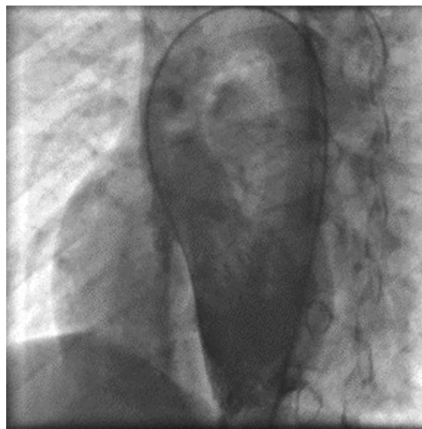
Figure 1. Left Ventriculogram at the Beginning of Procedure for Estimation of Perimembranous VSD Size and Relation to Aortic Valve

Percutaneous closure of a VSD was performed under general anesthesia. Femoral vein and arterial line were obtained. For procedure we gave 100 IU/kg heparin in two divided doses (50 IU/kg at first and 50 IU/kg half an hour later) for each patient to maintain activated clotting time longer than 200 sec after obtaining the femoral artery. Intravenous antibiotic with 30 mg/kg Cefazolin was administered prophylactically at beginning of the procedure and two subsequent doses 8 hours during the following 24 hours. The procedure was performed under fluoroscopic and transthoracic echocardiographic (TTE) control. Standard right and left cardiac catheterization and angiography were performed and data was gathered. During the cardiac procedure angiographic and catheterization data including size and type of VSD, its relation to aorta and being of an aneurysmal formation of VSD were obtained from the ventriculogram in left-anterior-oblique (LAO) in different degree's and also right-anterior-oblique (RAO) views for relation by pulmonary artery (Figure 1).