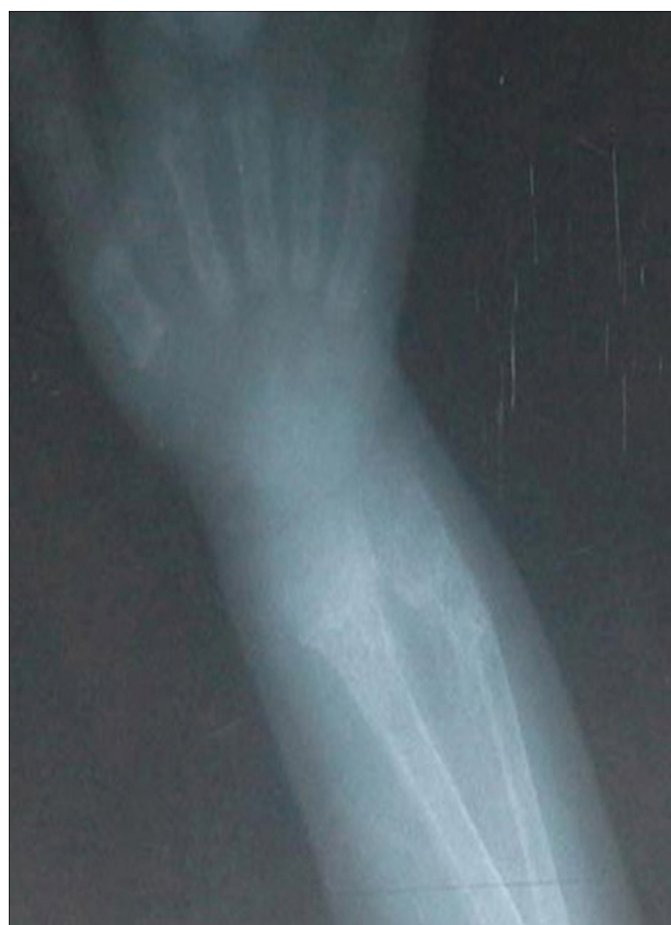
Figure 1. X-Ray of the Radius and Ulna Showing Hypophosphatemic Rickets With Fracture