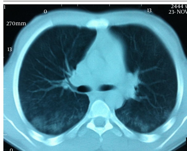
Figure 1. More Distinct Diffuse Ground Glass Densities in Both Lungs at Posterobasal Zones

A 9 year-old male patient was admitted to our clinic with complaints of paleness, weakness and hemoptysis since 3 - 4 days ago. His body weight was 26 kg (10 percentile) and height was 130 cm (25 - 50 percentile). Apart from 1/6 systolic murmur in cardiac examination, no specific sign was determined. The peripheral blood smear was compatible with severe hypochromic microcytic anemia. Bone marrow biopsy revealed active erythropoiesis. Laboratory data are as follow: serum iron 18 µg/dL, TIBC 404 µg/dL, ferritin 12 ng/mL. The thoracic CT scan revealed areas of higher density with ground glass appearance characterized by extensive alveolar involvement in both lungs. Fiberoptic bronchoscopy was performed and many hemosiderin laden macrophages were found in BAL fluid. Diagnosed with IPH parenteral steroid treatment with a dose of 2 mg/kg/day was initiated and erythrocyte transfusion support provided. Since the Anti Gliadin IgA and IgG and Anti Endomysium antibodies were found to be positive, GIS endoscopy was performed and the duodenal biopsy revealed MARSH 3B histological findings compatible with celiac disease (Figure 3). No remarkable finding was established in other examinations. Gluten-free diet was commenced for celiac disease. In the follow-up, steroid treatment was tapered gradually and discontinued, gluten-free diet was continued and hemoglobin level returned to normal in nine months.