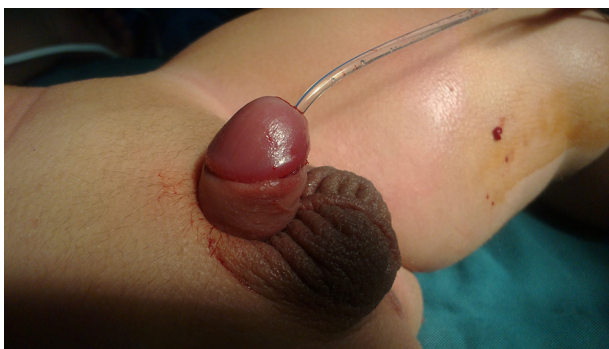
Figure 5. 7 Days After Surgery