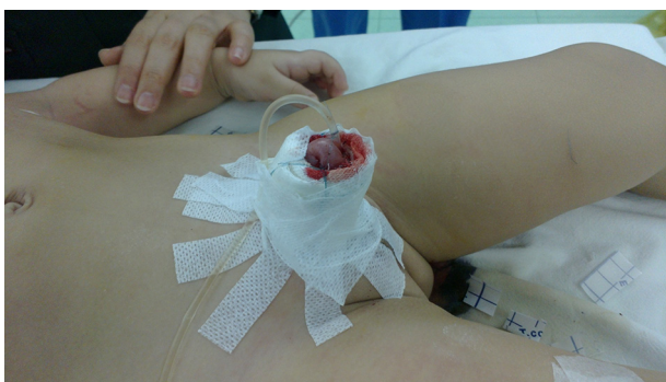
Figure 4. Sandwich Dressing