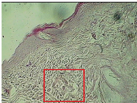
Figure 2: Histologic examination of the skin treated with the ointment of E. cyparissias at a concentration of 2% (Col. H&E x 200).

Histological sections revealed that the epidermis has a normal appearance with multi-layered intact epithelium, where there are vacuolated keratinocytes but in reduced proportion ( red ). Skin thickness is maintained within normal limits. In the dermis were revealed very few inflammatory cells ( orange ). Also glandular structures (in particular, the sebaceous gland ( blue ) corneous formations (hair) do not show significant changes.