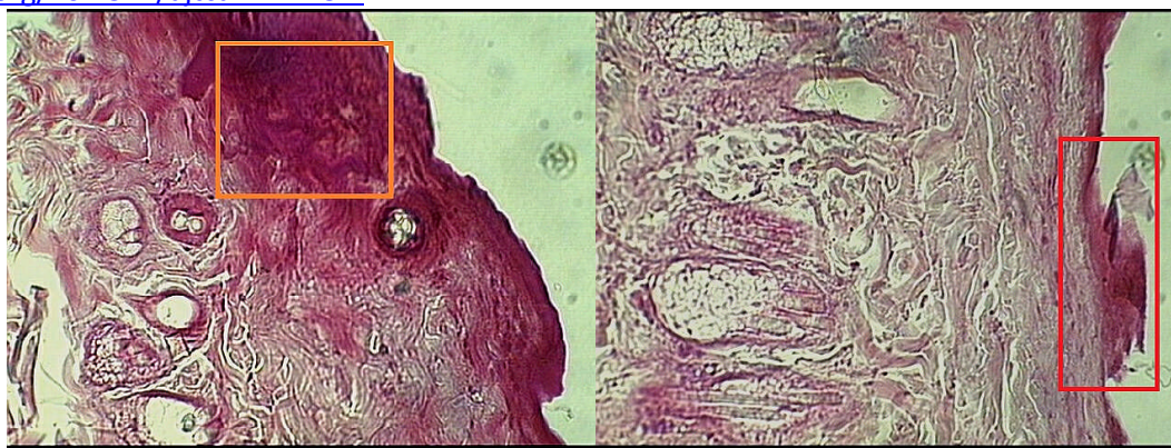
Figure 3. (Col. H&amp;E x 200)