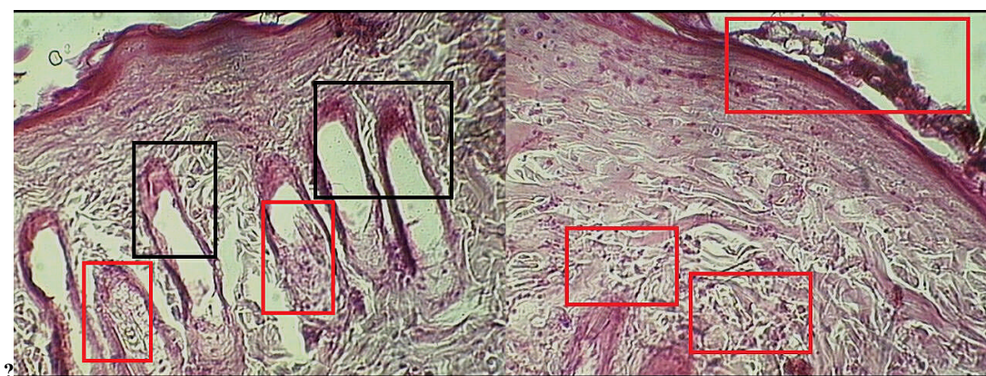
Figure 5. (Col. H&amp;E x 200)

Histologic examination of the skin showed for both concentrations, but especially for the higher one, development of the contact dermatitis phenomena. Diskeratosi, hypo- or parakeratosis ( orange ) it was observed also altered membrana basalis and circumscribed cellular infiltrations in dermis were observed, as the occurrence of specific inflammatory process ( red ).