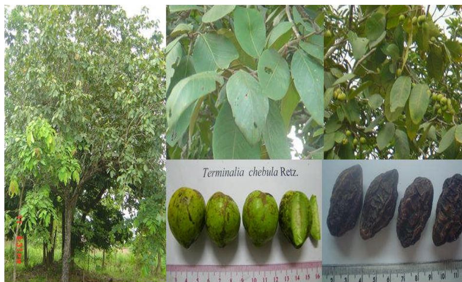
Figure 1: Terminalia chebula Retz.

Terminalia chebula Retz, family Combretaceae, is known as “Sa Maw Thai” in Thailand. T. chebula tree is medium-sized or large, attaining a height of up to 30 meter, with wide spreading branches and a broad roundish crown. The leaves are glabrous with a yellowish pubescence below. The flowers are monoecious, dull white to yellow. They are terminal spikes or short panicles and have a strong unpleasant odor. The fruits are usually smooth or frequently 5-ridged, ellipsoid to ovoid drupes, and yellow to orange brown in color, (Department of Medical Sciences, 2000) as shown in Figure 1.